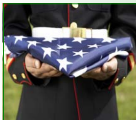
Memorial Day May 26th

With the summer, comes two national holidays honoring the patriotism of the past through the people of the present and future. This July 4th will mark the two hundred and thirty-two year existence of America. It is the date that our nation declared itself independent based upon the rights of life, liberty, and the pursuit of happiness. Indeed, since the moment the Founding Fathers fought with their words and the Continental soldiers offered their service and lives, America has