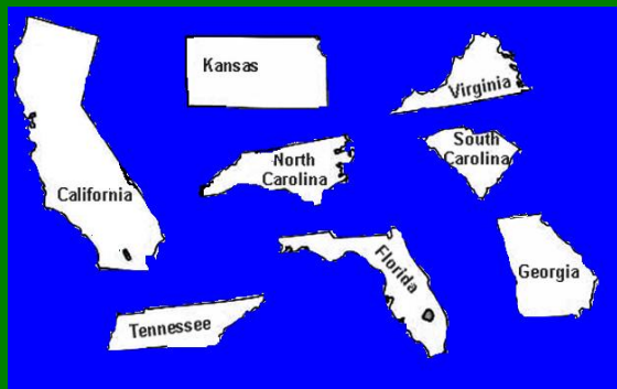
PMGA'S CERTIFIED STATES

The staff at PMGA would like to wish everyone a safe and enjoyable summer!