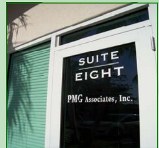
Main Office Located at Coconut Creek